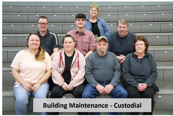
Building Maintenance - Custodial