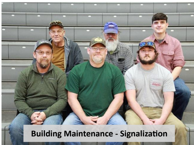
Building Maintenance - Signalization