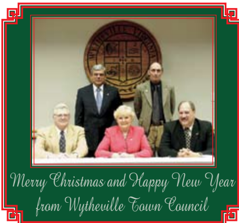
Merry Christmas and Happy New Year from Wytheville Town Council

It's a great opportunity to grow your own fresh produce and also make a new gardening friend or two. To reserve your spot in the Community Garden, please contact the Town of Wytheville Department of Public Information/Tourism at 223-3505 or email at cvb@wytheville.org. Plots are reserved on a first come, first serve basis.