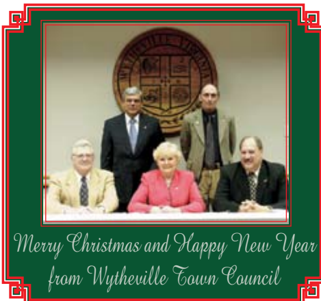
Merry Christmas and Happy New Year from Wytheville Town Council

It's a great opportunity to grow your own fresh produce and also make a new gardening friend or two. To reserve your spot in the Community Garden, please contact the Town of Wytheville Department of Public Information/Tourism at 223-3505 or email at cvb@wytheville.org. Plots are reserved on a first come, first serve basis.