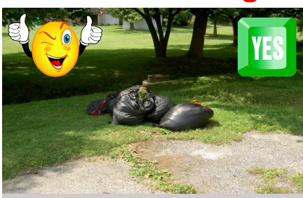
SORT LEAVES AND GRASS CLIPPINGS INTO SEPARATE PILES; GRASS CLIP-PINGS MUST BE BAGGED OR IN CON- TAINERS