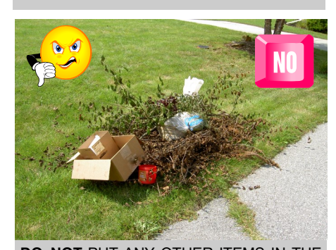
DO NOT PUT ANY OTHER ITEMS IN THE