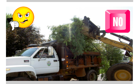
MORE THAN ONE DUMP TRUCK LOAD (10 FT. X 7 FT. X 4 FT.) PER HOUSEHOLD