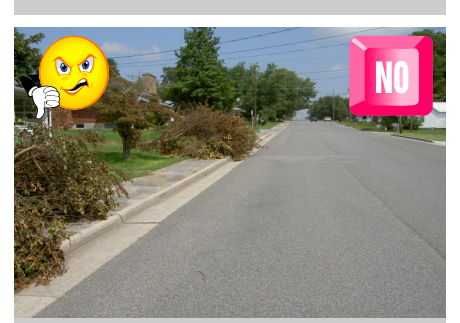
<u>DO NOT</u> PLACE BRUSH, GRASS CLIP-PINGS, OR LEAVES IN THE TRAVEL LANE OR BLOCK SIDEWALKS