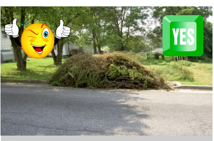
ARRANGE ALL BRANCHES IN THE SAME DIRECTION PARALLEL TO STREET