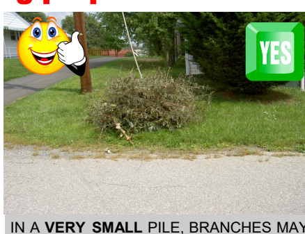
IN A <u>VERY SMALL</u> PILE, BRANCHES MAY BE IN DIFFERENT DIRECTIONS